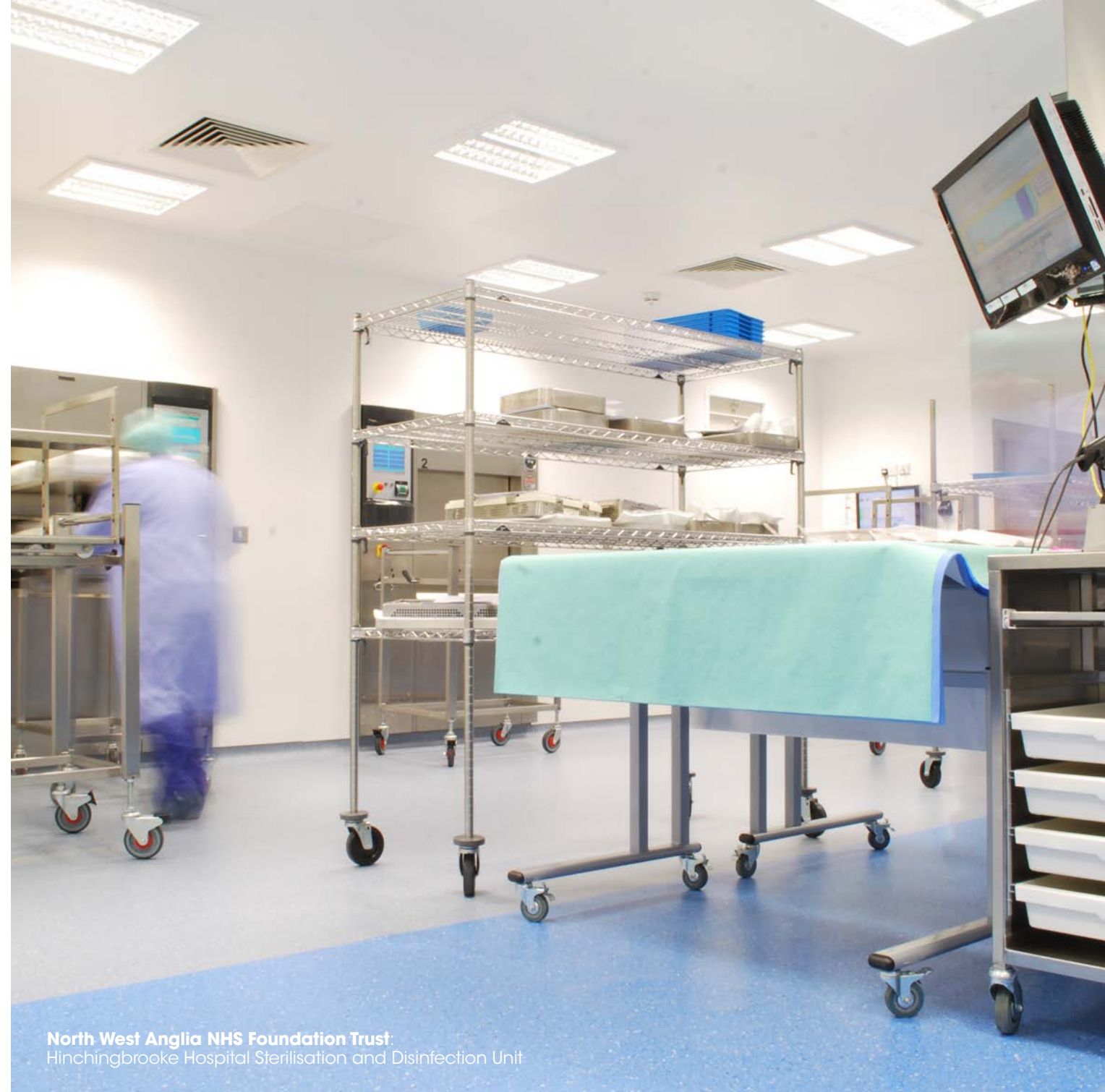
North West Anglia NHS Foundation Trust: Hinchingsbrooke Hospital Sterilisation and Disinfection Unit

Our clients include NHS Property Services, GP Clinical Commissioning Groups, NHS Foundation Trusts, NHS Acute Trusts, NHS Mental Health Trusts, PFI project companies and organisations who require a more detailed survey for future maintenance and strategic planning.