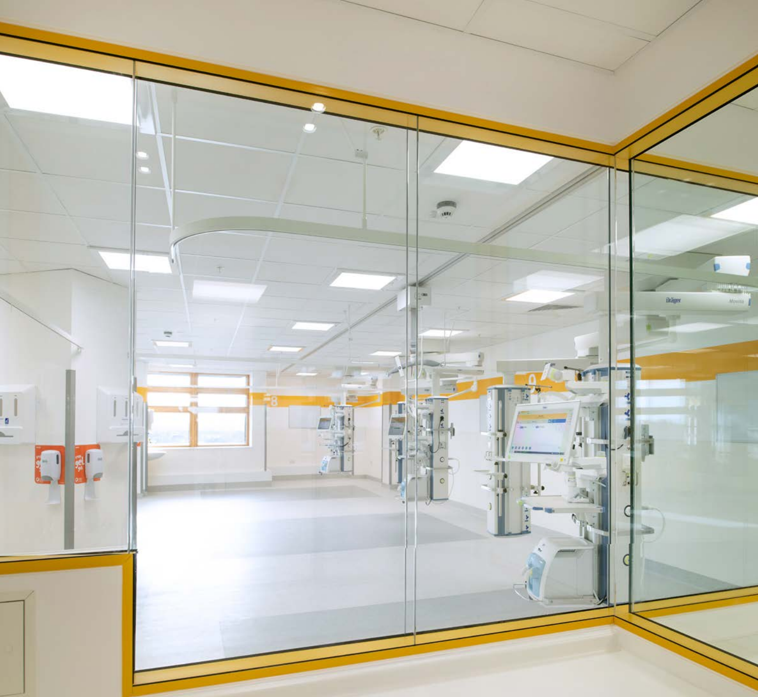
Barking, Havering and Redbridge University Hospitals: Queens Hospital Critical Care Unit